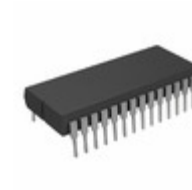
AT28C256-20DM/883-815 Micrel / Microchip Technology IC EEPROM 256K PARALLEL 28CDIP