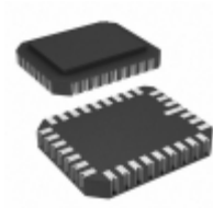
AT28C256-20LM/883-815 Micrel / Microchip Technology IC EEPROM 256KBIT 200NS 32CLCC