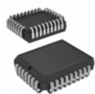
AT28C256-20JI Micrel / Microchip Technology IC EEPROM 256KBIT 200NS 32PLCC