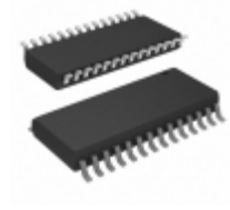
PIC24FJ32GA002-E/SO Micrel / Microchip Technology IC MCU 16BIT 32KB FLASH 28SOIC