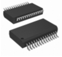
PIC24FJ32GA002-I/SS Micrel / Microchip Technology IC MCU 16BIT 32KB FLASH 28SSOP