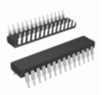
PIC24FJ32GA002-E/SP Micrel / Microchip Technology IC MCU 16BIT 32KB FLASH 28SDIP