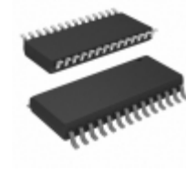
PIC24FJ32GA002-I/SO Micrel / Microchip Technology IC MCU 16BIT 32KB FLASH 28SOIC