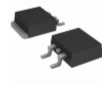
SUM90N08-4M8P-E3 Electro-Films (EFI) / Vishay MOSFET N-CH 75V 90A D2PAK