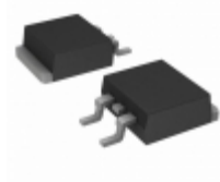
SUM90N06-5M5P-E3 Electro-Films (EFI) / Vishay MOSFET N-CH 60V 90A D2PAK