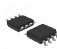
S25FL116K0XMFB013 Cypress Semiconductor IC FLASH 16M SPI 108MHZ 8SO