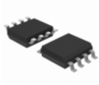
S25FL116K0XMFA013 Cypress Semiconductor IC FLASH 16M SPI 108MHZ 8SO