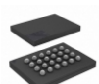
S25FL116K0XBHV030 Cypress Semiconductor Corp IC FLASH 16MBIT 108MHZ 24BGA