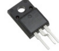
FCPF20N60TYDTU AMI Semiconductor / ON Semiconductor MOSFET N-CH 600V 20A TO-220F