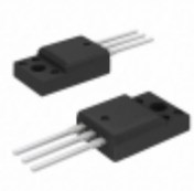
FCPF20N60FS AMI Semiconductor / ON Semiconductor MOSFET N-CH 600V 20A TO-220F