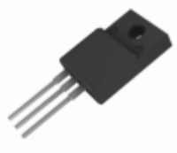
FCPF20N60 Fairchild/ON Semiconductor MOSFET N-CH 600V 20A TO220F