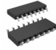
LTC1590IS#TRPBF Linear Technology / Analog Devices IC D/A CONV 12BIT DUAL 16-SOIC