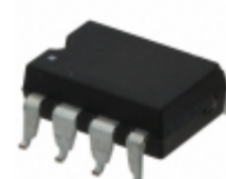
LBB127P IXYS Integrated Circuits Division RELAY OPTOMOS 200MA DP-NC 8FLTPK