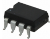
LBB120S IXYS Integrated Circuits Division RELAY OPTOMOS 170MA DP-NC 8-SMD