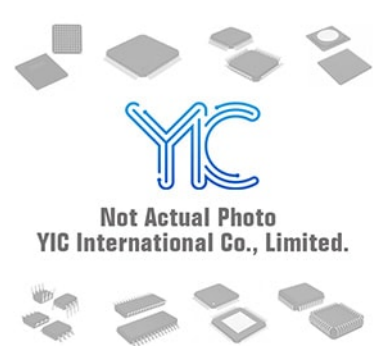
Image may be representation. See specs for product details.