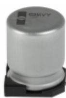
EMVY6R3ARA332MKG5S Nippon Chemi-Con CAP ALUM 3300UF 20% 6.3V SMD