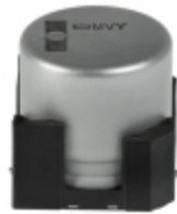
EMVY6R3GDA222MLH0S Nippon Chemi-Con CAP ALUM 2200UF 20% 6.3V SMD