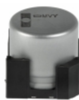
EMVY6R3GDA682MLN0S Nippon Chemi-Con CAP ALUM 6800UF 20% 6.3V SMD