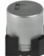
EMVY6R3GDA822MMN0S Nippon Chemi-Con CAP ALUM 8200UF 20% 6.3V SMD