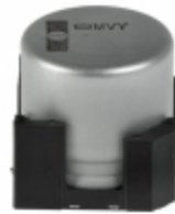
EMVY6R3GDA472MLN0S Nippon Chemi-Con CAP ALUM 4700UF 20% 6.3V SMD