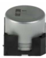
EMVY6R3GDA332MMH0S Nippon Chemi-Con CAP ALUM 3300UF 20% 6.3V SMD