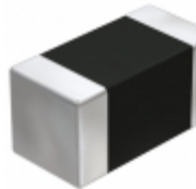
UMK105BJ332MV-F Taiyo Yuden CAP CER 3300PF 50V X5R 0402