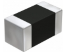
UMK105BJ472KV-F Taiyo Yuden CAP CER 4700PF 50V X5R 0402