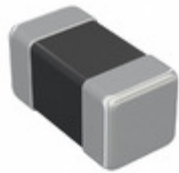
UMK105BJ471KV-F Taiyo Yuden CAP CER 470PF 50V X5R 0402