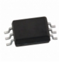
ACPL-P302-560E Avago Technologies (Broadcom Limited) OPTOISO 3.75KV GATE DRIVER 6SO