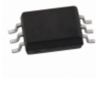
ACPL-P302-060E Avago Technologies (Broadcom Limited) OPTOISO 3.75KV GATE DRIVER 6SO