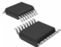
LTC1559CGN-3.3 ADI (Analog Devices, Inc.) IC BACKUP BATT CNTRLR3.3V 16SSOP