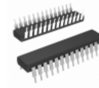
PIC24FJ64GA002-I/SP Micrel / Microchip Technology IC MCU 16BIT 64KB FLASH 28SDIP