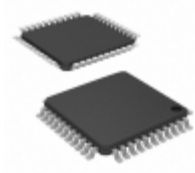
PIC24FJ64GA004-E/PT Micrel / Microchip Technology IC MCU 16BIT 64KB FLASH 44TQFP