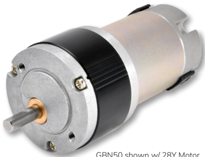
GBN50 shown w/ 28Y Motor