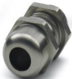
Cable gland, cable gland material: Stainless steel 1.4305, external cable diameter 5 mm ... 10 mm, shielding: no, connecting thread: M16 x 1.5, color: silver, with O-ring

Please be informed that the data shown in this PDF Document is generated from our Online Catalog. Please find the complete data in the user's documentation. Our General Terms of Use for Downloads are valid ( http://phoenixcontact.com/download )