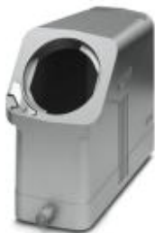
HEAVYCON EVO sleeve housing, EMC version, without powder coating, with bayonet flange for EVO screw connection, B24, for single locking latch, height: 88 mm, without EVO screw connection.

Please be informed that the data shown in this PDF Document is generated from our Online Catalog. Please find the complete data in the user's documentation. Our General Terms of Use for Downloads are valid ( http://phoenixcontact.com/download )