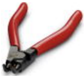
Removal tool for HC-M-EMV contact carriers

Removal tool - HC-M-EMV-KON-EWZ - 1678635