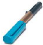
Contact removal tool, for turned and rolled CK- 1.6-... contacts