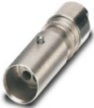
EMC contact carrier, 4-pos., shielded to connect shielded conductors from 3 - 6 mm conductor external diameter, male

Please be informed that the data shown in this PDF Document is generated from our Online Catalog. Please find the complete data in the user's documentation. Our General Terms of Use for Downloads are valid ( http://download.phoenixcontact.com )