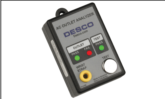
Figure 1. Desco 98132 AC Outlet Analyzer and Wrist Strap Tester