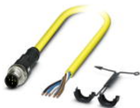
Sensor/actuator cable, 5-position, PVC, yellow, Plug straight M12 SPEEDCON, A-coded, on free cable end, cable length: 2 m

Please be informed that the data shown in this PDF Document is generated from our Online Catalog. Please find the complete data in the user's documentation. Our General Terms of Use for Downloads are valid ( http://phoenixcontact.com/download )