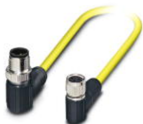
Sensor/actuator cable, 3-position, PVC, yellow, shielded, Plug angled M12 SPEEDCON, A-coded, on Socket angled M8, cable length: 0.5 m

Please be informed that the data shown in this PDF Document is generated from our Online Catalog. Please find the complete data in the user's documentation. Our General Terms of Use for Downloads are valid ( http://phoenixcontact.com/download )