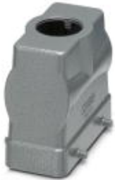
HEAVYCON B16 sleeve housing, for double locking latch, height: 76 mm, with 1 x M25 thread, straight cable outlet

Please be informed that the data shown in this PDF Document is generated from our Online Catalog. Please find the complete data in the user's documentation. Our General Terms of Use for Downloads are valid ( http://download.phoenixcontact.com )