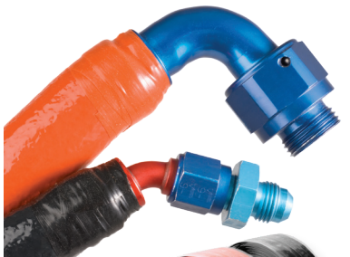
FireFlex® Seal Tape works perfectly in conjunction with FireFlex®...it seals the ends of your application, providing a neat, insulated termination. For more info go to page 113.

FireFlex® firesleeve is completely non-conductive, will not melt, delaminate, become brittle, or support combustion under normal conditions. It provides a professional level solution to thermal protection needs in any application.