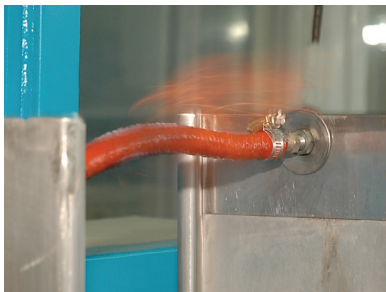
TechFlex® silicone jacketed fiberglass is tested under pressure to destruction to ensure reliable fire protection for your fuel and hydraulic lines.

Silicone jacketed fiberglass sleeving is the choice of professionals in racing and other industries where protection from constant temperatures approaching 500°F is mandatory.