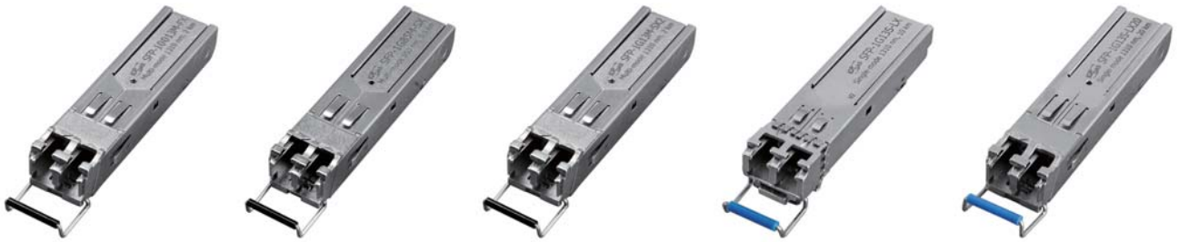
SFP-100M13M-FX SFP-1G85M-SX SFP-1G13M-SX2 SFP-1G13S-LX SFP-1G13S-LX20