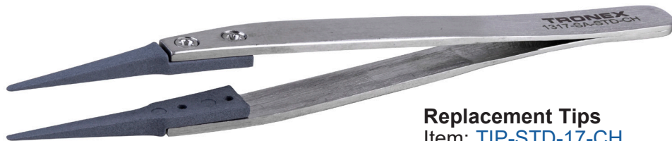
Replacement Tips Item: TIP-STD-17-CH