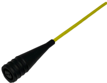
CMCP602HST Push On IP68 Connector