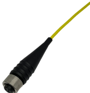
CMCP603H 3 Socket Locking Collar