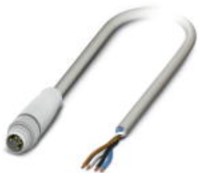
Sensor/actuator cable, 4-position, PP-EPDM halogen-free, gray RAL 7035, Plug straight M8, on free cable end, cable length: 5 m, Hygienic design, with plastic knurl

Please be informed that the data shown in this PDF Document is generated from our Online Catalog. Please find the complete data in the user's documentation. Our General Terms of Use for Downloads are valid ( http://phoenixcontact.com/download )