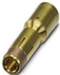
Crimp contact, turned, Single contact, contact diameter: 3.6 mm, crimp range: 16 mm 2 ... 16 mm 2

Please be informed that the data shown in this PDF Document is generated from our Online Catalog. Please find the complete data in the user's documentation. Our General Terms of Use for Downloads are valid ( http://phoenixcontact.com/download )