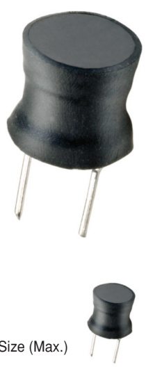
Actual Size (Max.)