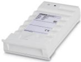
Replacement battery for the THERMOMARK PRIME, NiMH 18 V DC, 2.1 Ah

Please be informed that the data shown in this PDF Document is generated from our Online Catalog. Please find the complete data in the user's documentation. Our General Terms of Use for Downloads are valid ( http://phoenixcontact.com/download )