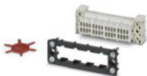
The figure shows the 32-pos. version

Contact insert set for mounting side, sleeve frame with PE, 4 fixing screws, 8-pos. contact inserts preassembled, 6 coding profiles, 2 mounting flanges