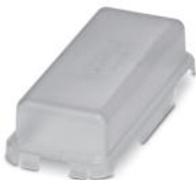
Protective covers, type: B16, degree of protection: IP20, color: transparent/white

Please be informed that the data shown in this PDF Document is generated from our Online Catalog. Please find the complete data in the user's documentation. Our General Terms of Use for Downloads are valid ( http://phoenixcontact.com/download )