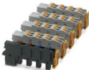
Axioline F connector set (for e.g., AXL F DI32/1 1F)

Please be informed that the data shown in this PDF Document is generated from our Online Catalog. Please find the complete data in the user's documentation. Our General Terms of Use for Downloads are valid ( http://phoenixcontact.com/download )