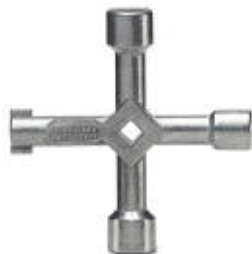
Control cabinet key, metal, for all common types of control cabinet

Please be informed that the data shown in this PDF Document is generated from our Online Catalog. Please find the complete data in the user's documentation. Our General Terms of Use for Downloads are valid ( http://download.phoenixcontact.com )