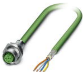
Bus system flush-type socket, PROFINET, 4-pos., M12, shielded, D-coded, SPEEDCON, rear/screw mounting with Pg9 thread, with 1.0 m bus cable, 2 x 2 x 0.34 mm 2

Please be informed that the data shown in this PDF Document is generated from our Online Catalog. Please find the complete data in the user's documentation. Our General Terms of Use for Downloads are valid ( http://phoenixcontact.com/download )