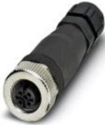
Sensor/actuator socket, straight, 4-pos., M12, A-coded, screw connection, metal knurl, cable gland Pg7 SKINTOP®

Please be informed that the data shown in this PDF Document is generated from our Online Catalog. Please find the complete data in the user's documentation. Our General Terms of Use for Downloads are valid ( http://download.phoenixcontact.com )