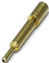
Crimp contact, turned, Single contact, contact diameter: 1 mm, crimp range: 1 mm 2 ... 1.5 mm 2

Please be informed that the data shown in this PDF Document is generated from our Online Catalog. Please find the complete data in the user's documentation. Our General Terms of Use for Downloads are valid ( http://phoenixcontact.com/download )