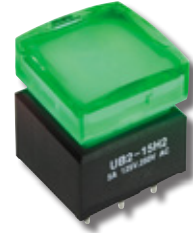
UB2 Series with Super Bright Green LEDs will Undergo Changes

The Super Bright Green LEDs for UB2 Series pushbutton switches and indicators will be changing. Both standard and custom pushbuttons and indicators are included in the revision. The change will effect electrical specifications, which are compared below. It will also effect the LED terminal dimensions and terminal plating, displayed on page 2. Part numbers for effected standard switches and indicators are shown on page 3.