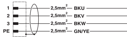
Contact assignment of M17 plugs/sockets