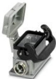
HEAVYCON box mounting base HV3, with single locking latch, height 52 mm, with support 1xM25, with cover

Please be informed that the data shown in this PDF Document is generated from our Online Catalog. Please find the complete data in the user's documentation. Our General Terms of Use for Downloads are valid ( http://phoenixcontact.com/download )