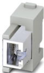
Contact insert module, number of positions: RJ45, type : RJ45, Socket, 50 V, 1 A, application: Data, Gender changer

Please be informed that the data shown in this PDF Document is generated from our Online Catalog. Please find the complete data in the user's documentation. Our General Terms of Use for Downloads are valid ( http://phoenixcontact.com/download )