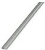
Continuous plug-in bridge, length: 500 mm, color: gray

Continuous plug-in bridge - FBST 500-PLC GY - 2966838