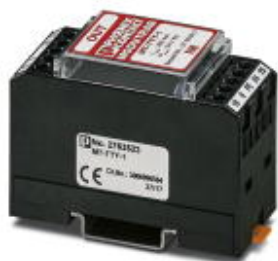
Rail-mountable module with surge protection for TTY interface, for mounting on NS 35/7.5, housing width: 30 mm

Please be informed that the data shown in this PDF Document is generated from our Online Catalog. Please find the complete data in the user's documentation. Our General Terms of Use for Downloads are valid ( http://phoenixcontact.com/download )