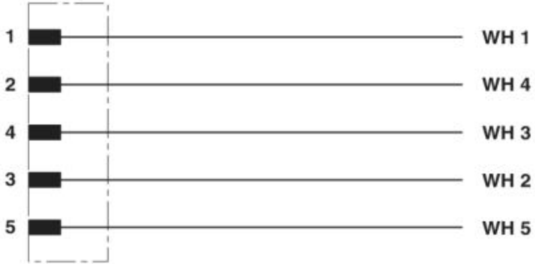
Contact assignment of the M12 plug