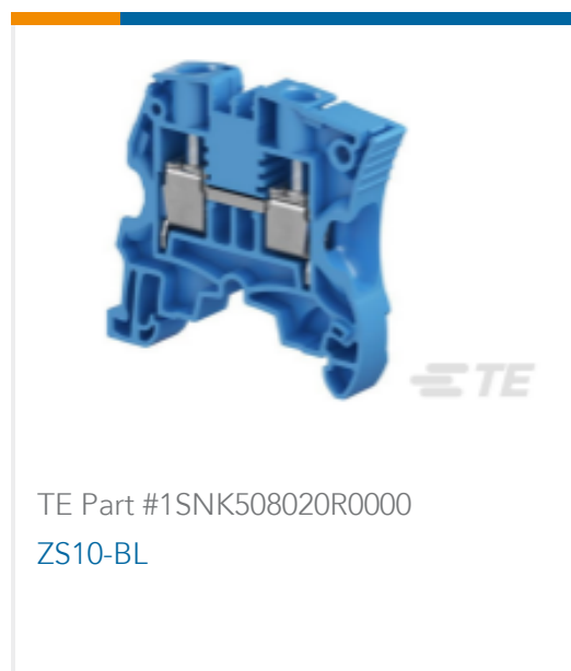
TE Part #1SNK508020R0000 ZS10-BL