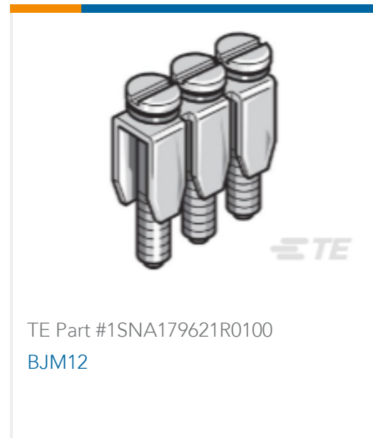
TE Part #1SNA179621R0100 BJM12