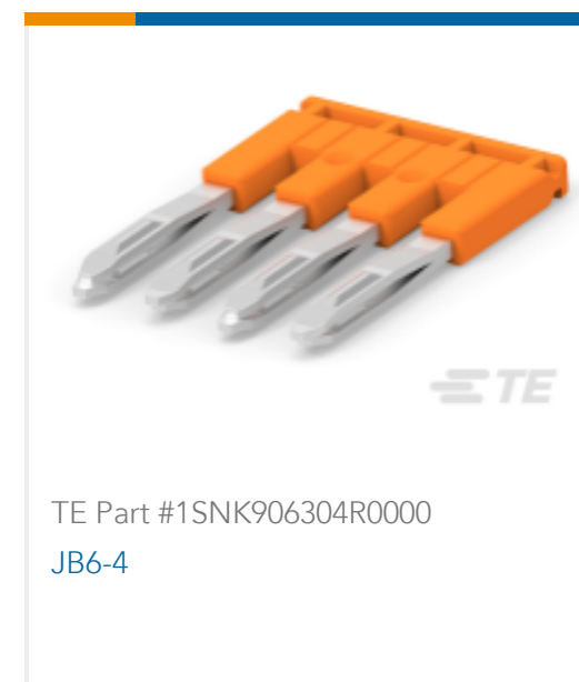
TE Part #1SNK906304R0000 JB6-4