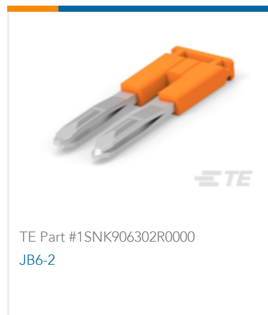
TE Part #1SNK906302R0000 JB6-2