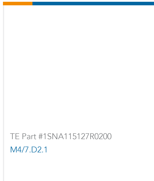
TE Part #1SNA115127R0200 M4/7.D2.1