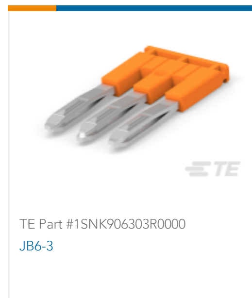
TE Part #1SNK906303R0000 JB6-3