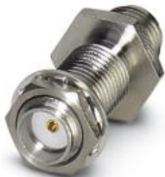
Antenna adapter for control cabinet feed-through, frequency range: 0.3 GHz ... 6 GHz, connection: 2 x SMA (female)

Please be informed that the data shown in this PDF Document is generated from our Online Catalog. Please find the complete data in the user's documentation. Our General Terms of Use for Downloads are valid ( http://phoenixcontact.com/download )