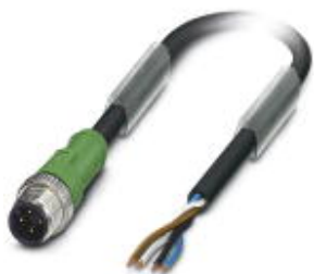
Sensor/actuator cable, 4-position, PUR, black-gray RAL 7021, Plug straight M12, A-coded, on free cable end, cable length: 2 m

Please be informed that the data shown in this PDF Document is generated from our Online Catalog. Please find the complete data in the user's documentation. Our General Terms of Use for Downloads are valid ( http://phoenixcontact.com/download )