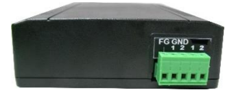
Back panel view