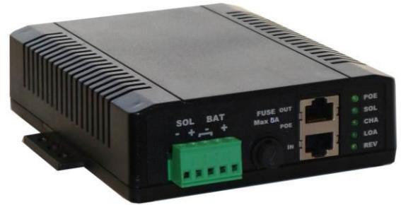
TP-SCPOE-2424-HP Charge Controller