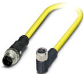
Sensor/actuator cable, 3-position, PVC, yellow, Plug straight M12 SPEEDCON, A-coded, on Socket angled M8, cable length: 1.5 m

Please be informed that the data shown in this PDF Document is generated from our Online Catalog. Please find the complete data in the user's documentation. Our General Terms of Use for Downloads are valid ( http://phoenixcontact.com/download )