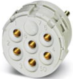
Contact insert, Number of positions: 6+3, Type of contact: Socket, Solder-in connection

Please be informed that the data shown in this PDF Document is generated from our Online Catalog. Please find the complete data in the user's documentation. Our General Terms of Use for Downloads are valid ( http://phoenixcontact.com/download )