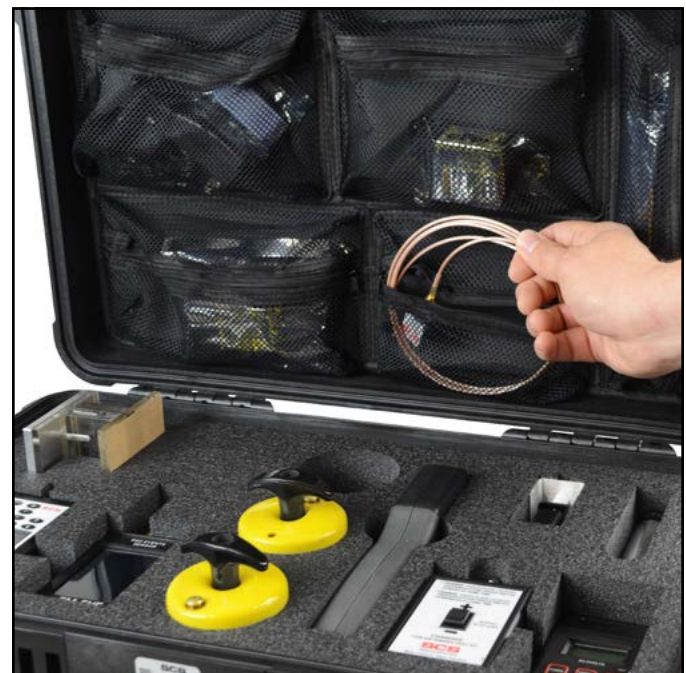
Figure 2. Using the EOS/ESD Assessment Kit's lid organizer

The ESD Program Standard ANSI/ESD S20.20 can be downloaded here: https://www.esda.org/standards/esda-documents/