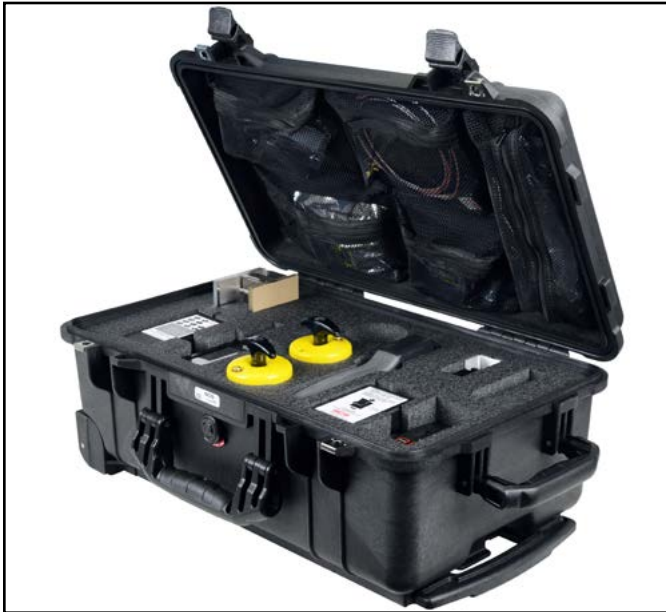
Figure 1. SCS 770045 EOS/ESD Assessment Kit